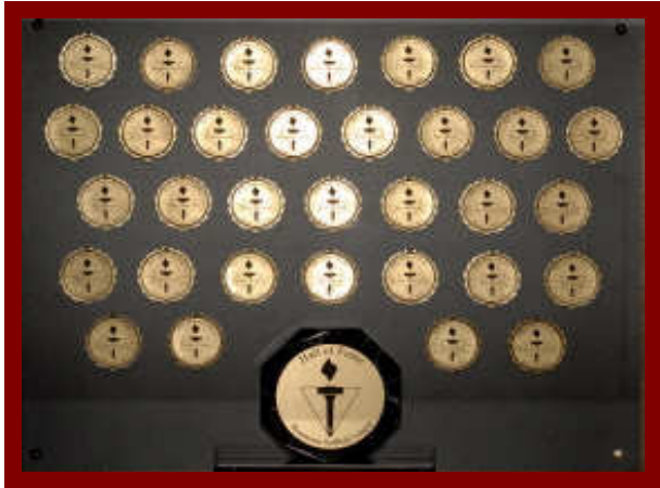
The Hall of Fame Member Display Housed in the Club Café Trophy Case awaits new additions very soon!