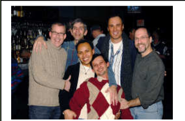
The Winter Dinner Social brings together HOF members, BSL alumni, BSL members and friends! See page 2