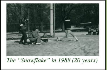
The "Snowflake" in 1988 (20 years)