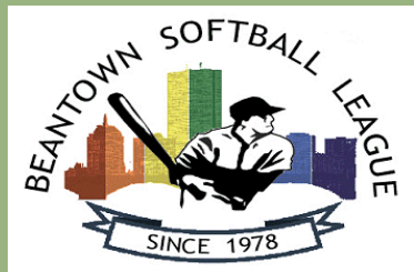
The Official BSL Logo (2008)

We're on the Web http://www.beantownsoftball.com/hall_of_fame/