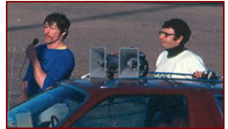
Calling All BSL Alumni!! We'd love to see some familiar faces from the 1970's, 80's, & 90's at our Winter event!