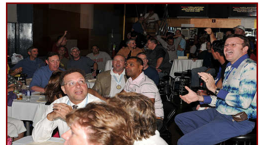
Crowd sings the lyrics of "Sweet Caroline" from the Karaoke video monitors to end the evening!