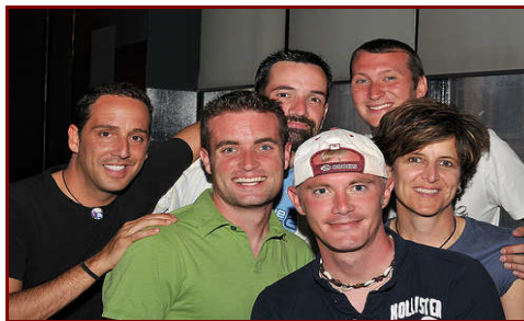
Some 1st year BSL members from 1 of the 4 brand new BSL teams in 2008: "Good Times"