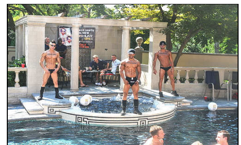
Defibrillators were on hand for any HOF members needing cardiac assistance! ....Yike!!