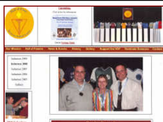
HOF Website updates!