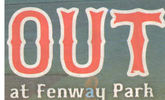
BSL, with other gay sports groups, officially attend Fenway- 5 yrs ago!