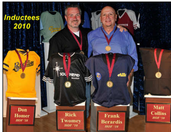
Hall of Fame Induction Day June 19, 2010