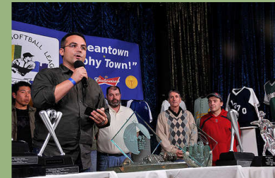
Champion Machine- 2000 Recount their success in Columbus!