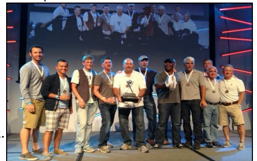
Club Cafe Angels GSWS Trophy - 3rd in B Division