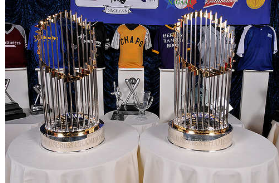
Red Sox & BSL World Series Trophies stand together!

Last February’s BSL Winter Social was another historic day! 20 years after the BSL began a winning tradition of having its teams contend and return to Boston from the NAGAAA World Series with the Championship trophy (7 in all), the Red Sox brought their own trophies over to Club Café to display alongside our own!