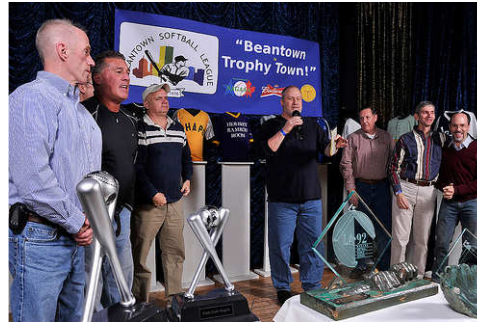
Fritz-’92 GSWS Champs -began the BSL’s Championship tradition 20 years ago!

Prompted by the unprecedented success of BSL teams returning 4 trophies from the Chicago World Series (including 2 Championships) the HOF invited all the Championship teams to receive the accolades they deserve: Fritz’92, Southenders’98, Jackhammers’00, Crew’08, Machine’10, Gators’11, and Goodtimes’11! during a fun and historic evening!